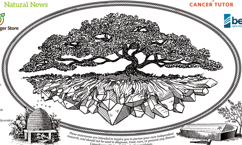
These statements are intended to inspire you to pursue your own independent research, and should not be used to diagnose, treat, cure, or prevent any disease. Consult your Higher Self for further guidance.

Hematite), Faraday Case (for cell-phone), Relocation (Escape EMF sources), Subterranean Bunkers. BONES, OSTEOPOROSIS: Causes: Chronic Toxicity, Pasteurized Milk, Vegan Frankenfood, Malnourishment. Pharma: Bisphosphonates, Calcium Milk, Holistic: Organic Raw Diet, Raw Meat, Raw Dairy, Bone Broth, Connective Tissue, Exercise, Physical Therapy, MSM, C60. DENTAL (Tooth Decay): Causes: Sugar, White Carbs, Malnutrition. Pharma: Mercury Fillings, Fluoride Toothpaste. Holistic: Brush & Floss, SLS & Fluoride Free Toothpaste, Remineralization, Organic Diet. VISION (Near / Far-Sightedness): Causes: Genetic and Environmental Factors, Eye Strain. Pharma: Optometry, Glasses, Contacts, Lasik, Surgery. Holistic: Vitamin A, Stenopetec Glasses, Sun Gazing, Blue Light Filtration. REGRETTED DECISIONS: Pharma: Ultrasound, Hospital Delivery, C-Section, Newborn Vaccines, Circumcision, Umbilical Cutting, Infant Trauma, Epidural, Birth Control, Formula, Twilight Sleep, Abortion. Holistic: Pre-Conception Detox, Home / Water / Hypno Birth, Placenta, Breastmilk, Unassisted. DEATH: Pharma: Hospice, Incineration, Death Tax, Egyptian Burial, Embalming, Euthanasia, Organ Donor. Holistic: Ascension, Reincarnation, Karma, Return to Source.